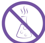
Eliminates odors and chemical contaminants