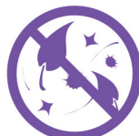
Eliminates volatile organic compounds (VOCs)