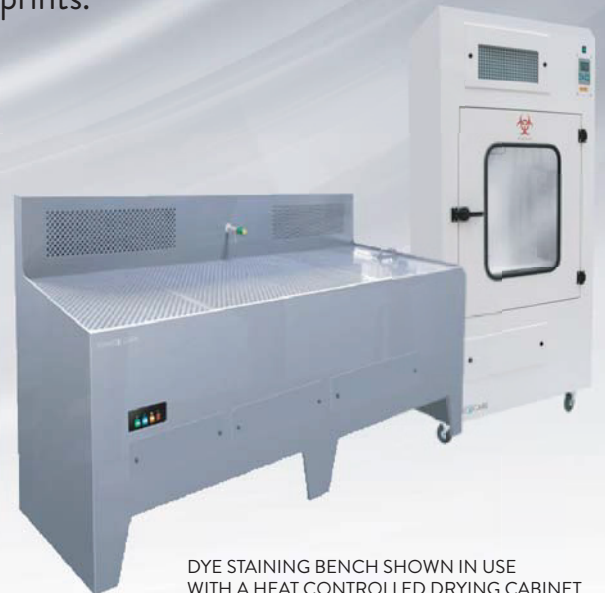
DYE STAINING BENCH SHOWN IN USE WITH A HEAT CONTROLLED DRYING CABINET

The safety alarm will alert the operator if worksurface face velocity falls below 0.3 M/Sec.