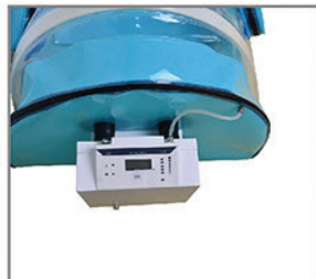
Negative Generation System